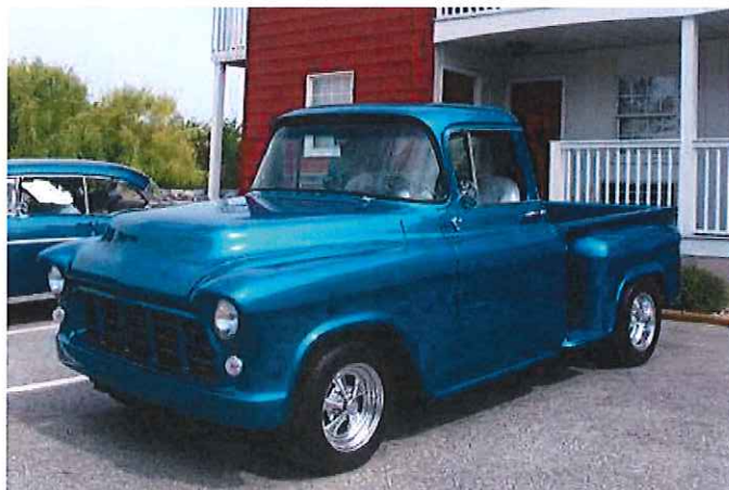
Butch Riley's 1955 step side pickup truck